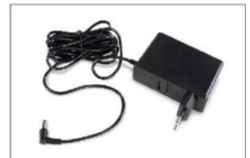
Ameda Pearl AC Power Adapter EU/UK/Asia AM.201X06