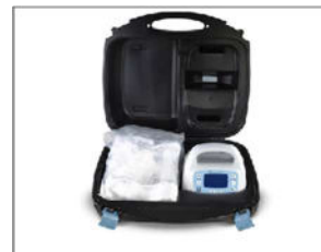
Ameda Pearl Hard Shell Transport & Storage Case AM.501M03