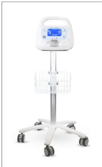
Ameda Pearl Trolley AM.201H01