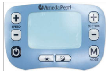
Ameda Pearl Replacement Screen Overlay Panel AM.201X04