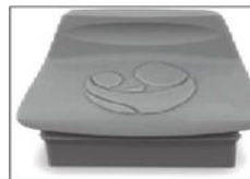
Ameda Pearl Tubing Port Cover AM.201X08