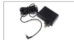
Ameda Pearl AC Power Adapter North America/AU/Philippines AM.201X05