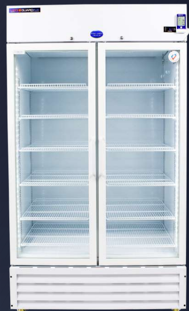
MEDI GUARD 401 PLUS