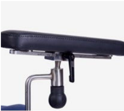
3D adjustable padded armrest