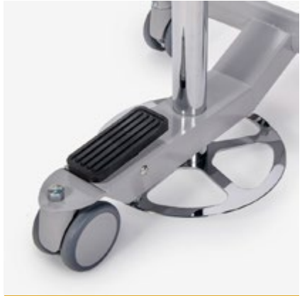
Height adjustment ring mechanism