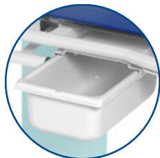
BA902 - Debris Bin