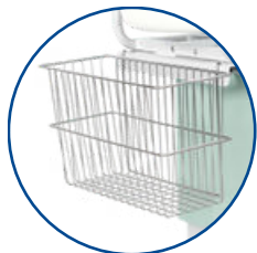
BA903 - Wire Basket