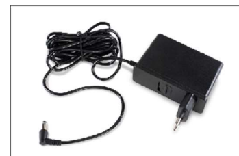
Ameda Pearl AC Power Adapter EU/UK/Asia AM.201X06