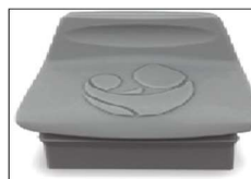
Ameda Pearl Tubing Port Cover AM.201X08