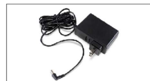
Ameda Pearl AC Power Adapter North America/AU/Philippines AM.201X05