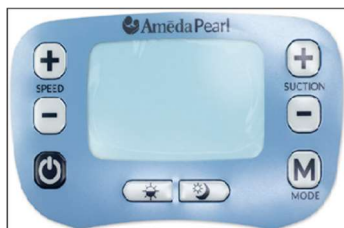
Ameda Pearl Replacement Screen Overlay Panel AM.201X04