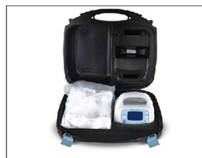
Ameda Pearl Hard Shell Transport & Storage Case AM.501M03