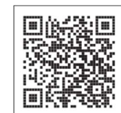
For more info about Ameda's patented HygieniKits