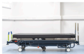
Ultra-low minimum height The industry-leading minimum height of 420 mm enables easier mobilisation & reduced the risk of fall-related injury.