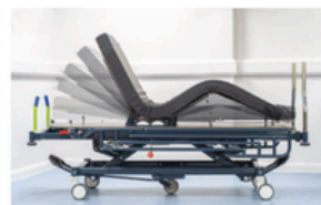
Electric height adjustment & profiling Fully electric functionality with battery backup enables smooth, comfortable profiling and height adjustment.